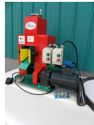
Teck & BX Cable Stripper Model TB350

Economical choices for removing Teck and BX cables.